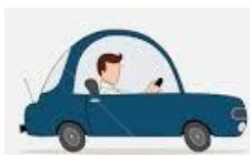
Commute to & from work

Sitting Disease Article —this link will take you directly to the article on the TRICO JIF website.