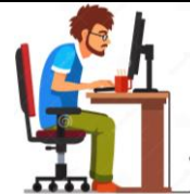
Sedentary Desk Job