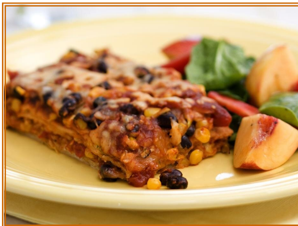
EatingWell Test Kitchen